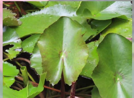
葉片有缺 leaf with notch